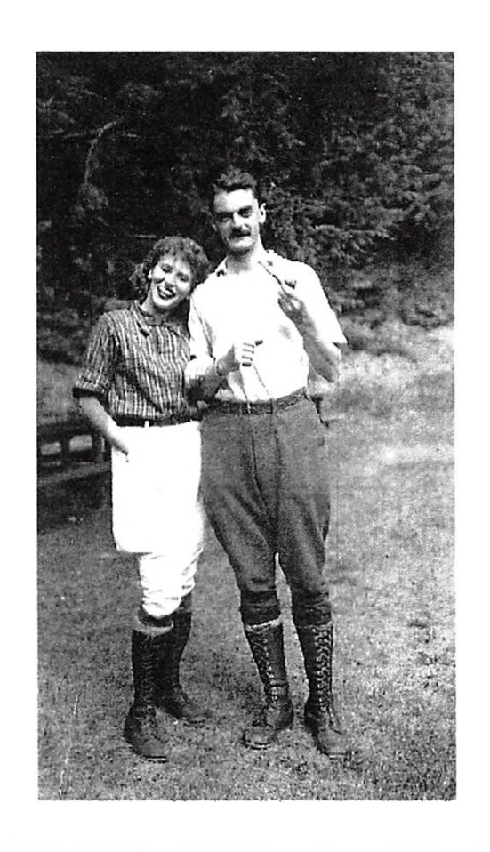
Don't Recognize the Subjects? See the Back Cover...